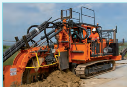
▶ One of the mechanical trenchers in action

The arrival of two large state-of-the-art Marais mechanical trenchers in the cable corridor signalled the next phase of the installation process, and currently the