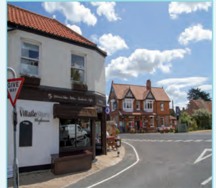
▶ Weybourne on the North Norfolk coast

Although the formalities to establish the Dudgeon Community Support Fund are still to be finalised, requests for grants for community projects in the villages along the onshore cable route from Weybourne to Necton can be submitted for consideration. Details of how and when to make such submissions will shortly be supplied to the Parish Councils along the cable route.