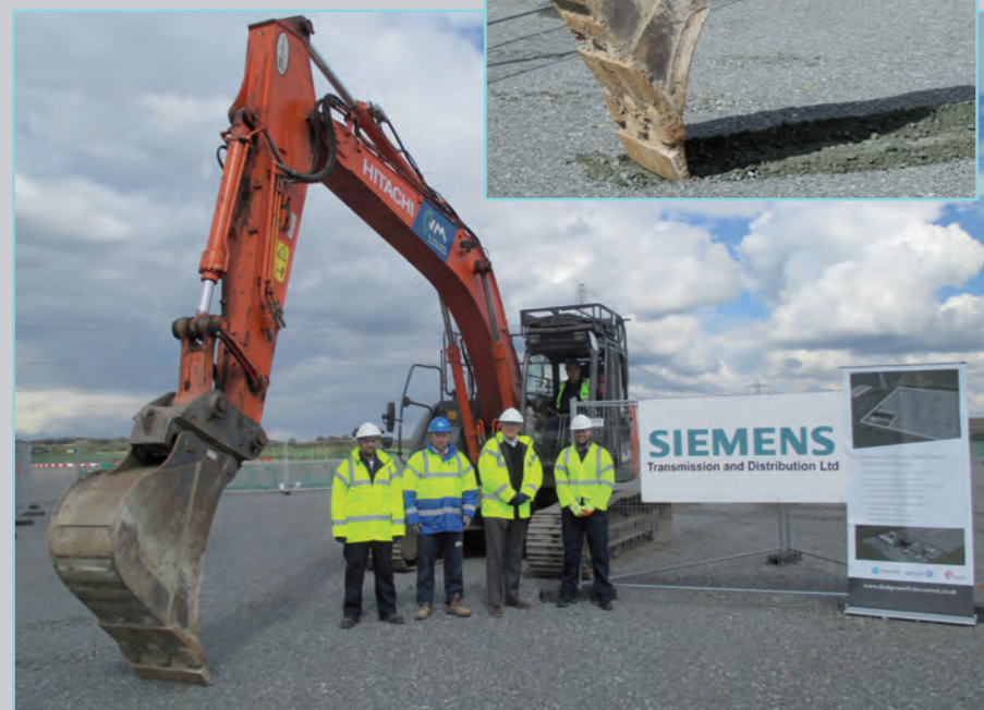
► Breaking ground at the Necton sub station site

Further information about these positions can be obtained by visiting the Dudgeon Offshore Wind Farm website at www.dudgeonoffshorewind.co.uk