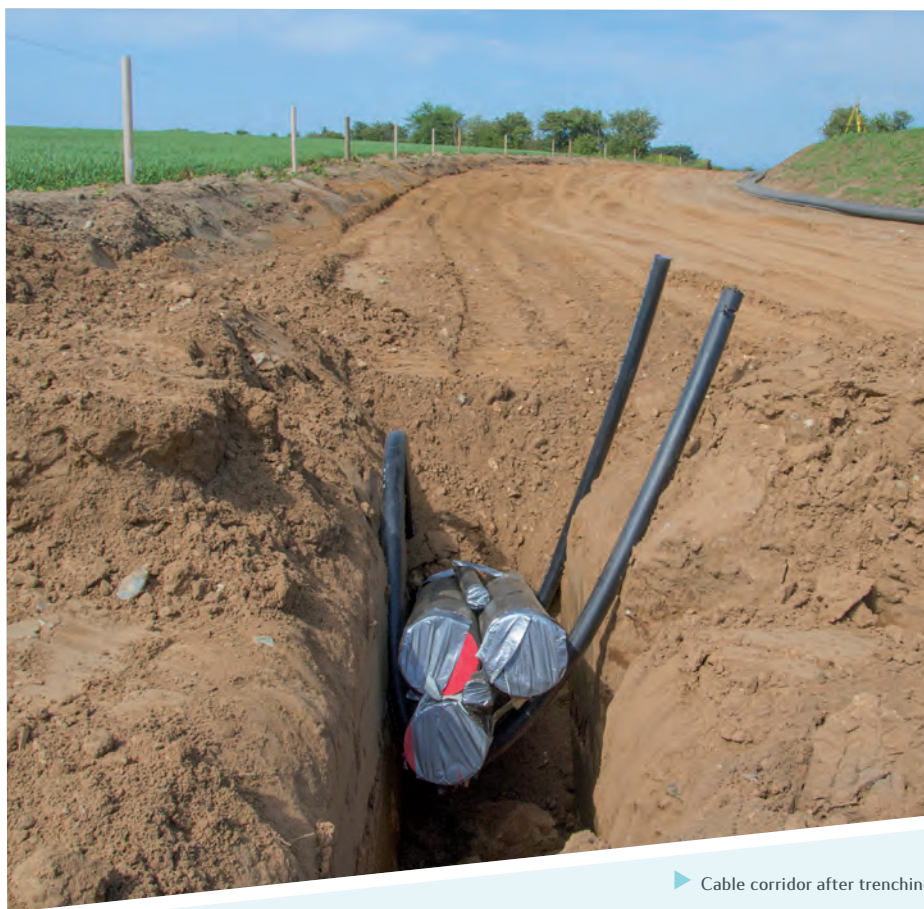
▶ Cable corridor after trenching

Chairman of the Dudgeon Board of Directors