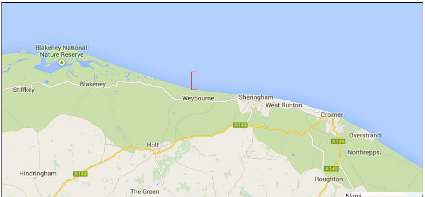
Overview of Project Area

The following figure shows an overview of the project area.